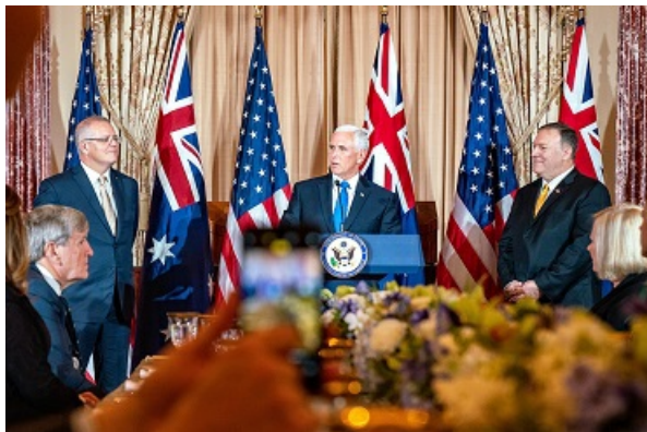
Scott Morrison with his "faith"-linked pals Mike Pence and Mike Pompeo: did these three use their professed "faith" as a cover for their warmongering?