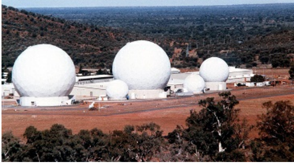
The Joint Defence Facility Pine Gap, in the Northern Territory, is used by the United States to collect intelligence and guide military strikes, including the Israeli strikes that are currently killing thousands of civilians in Gaza.

Prime Minister Anthony Albanese is once again earning his reputation as "Each-Way Albo" with his vacillating response to Israel's atrocities against the Palestinian people in Gaza. He has bemoaned the mass death of civilians but refused, when pressed, to support Foreign Minister Penny Wong's public demand that Israel comply with international law by ceasing its indiscriminate bombing of civilian areas and deliberate targeting of hospitals. The fact though is that far from Albanese having merely made no effort to stop Israel from committing war crimes in Gaza, he and his government have actually been complicit in them from the start, by allowing the United States to use the so-called "joint" signals intelligence base at Pine Gap, in the central Australian desert near Alice Springs, to collect and analyse battlefield intelligence on behalf of the Israeli military.