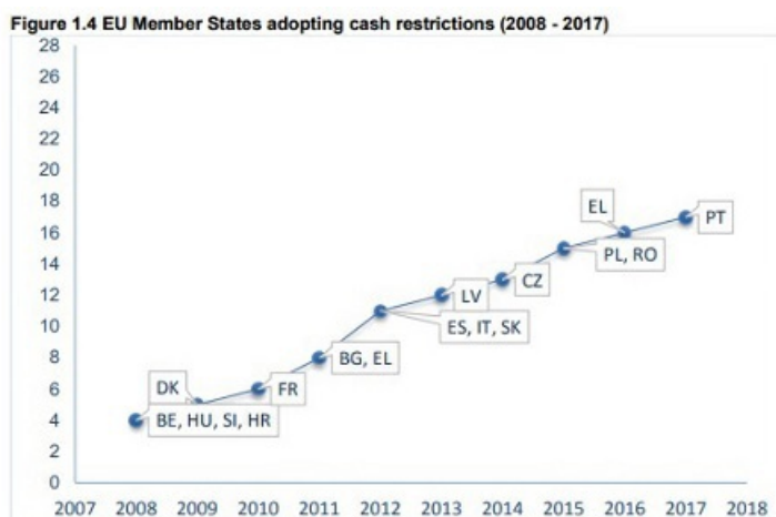
Timeline showing cash restrictions since the global financial crisis.

A quick look at the European experience dispels the Australian government’s claims that these policies are not motivating its bill, and gives a foretaste of what is to come.