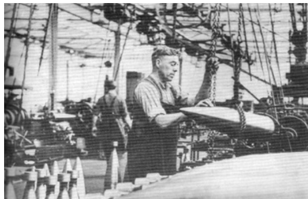
Production of shells at Maribyrnong, Victoria.

Five months later on the eve of war, the Royal Australian Air Force had 164 planes on the active list, of which seven were Wirraways. And when near the close of 1941 Japan entered the war, 101 of Australia's 177 first-line aircraft were Wirraways. It was unusual in the history of aircraft production because nearly all of its 50,000 parts were made in the one plant rather