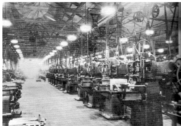
Production of arms at Lithgow, NSW.