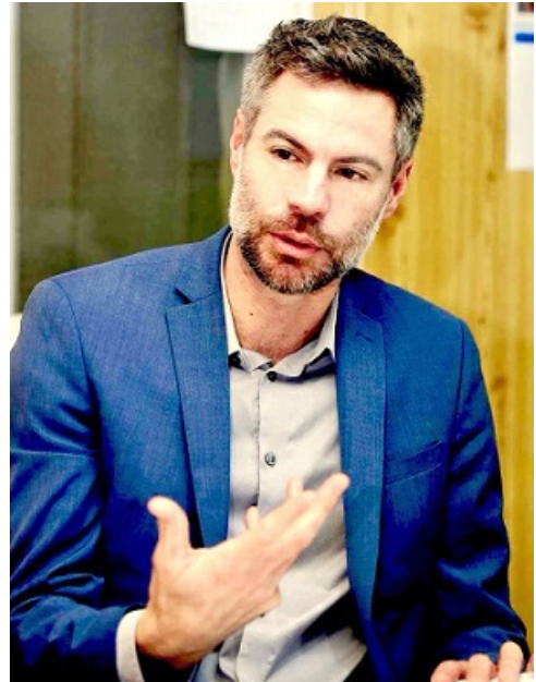
Michael Shellenberger.

On Sky News on 1 July Shellenberger described the “anti-human Malthusian tradition” that took over the conservation movement in the 1970s. He explained that under Malthusian environmentalist doctrine, the World Bank is now “funding programs to make poverty sustainable rather than to make poverty history”. The Malthusian tradition to which Shellenberger refers arises from Parson Thomas Malthus, chief economist of the British East India Company. In his infamous 1798 Essay on the Principle of Population Malthus advocated ways to manage the alleged overpopulation problem: “Instead of recommending cleanliness to the poor, we should encourage contrary habits. In our towns we should make the streets narrower, crowd more people into houses, and court the return of the plague. In the country we should build our villages near stagnant pools, and particularly encourage settlements in all marshy and unwholesome situations.”