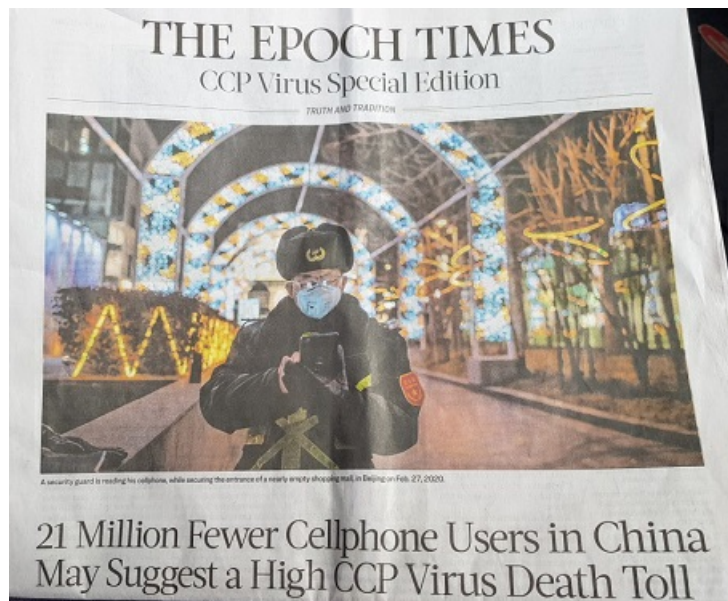
Falun Gong's newspaper.