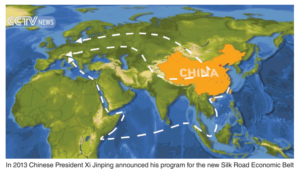
China: Glass-Steagall Banking System and the Belt and Road 67

(top two broken white lines) and the 21st Century Maritime Silk Road (lower broken line). Togeth-