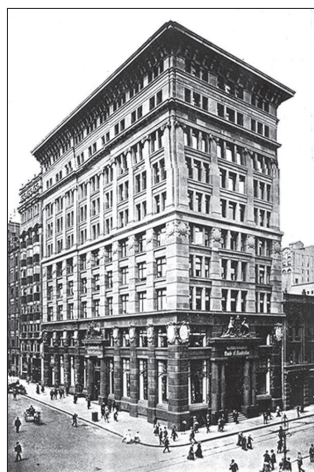
The Commonwealth Bank, Martin Place, Sydney.