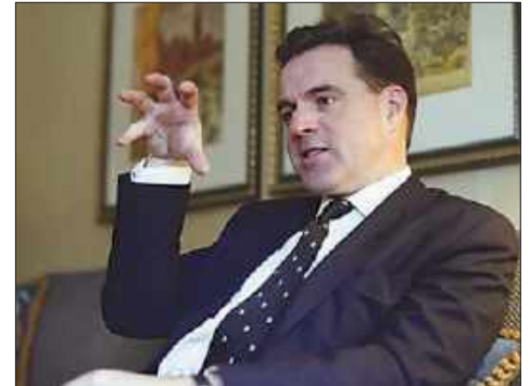
Niall Ferguson lied that China intentionally spread COVID-19.

education, and technical training both on the ground and in Japan. They were very much aware that this went against the standard operating procedures of the former colonial powers who ran the IMF and the World