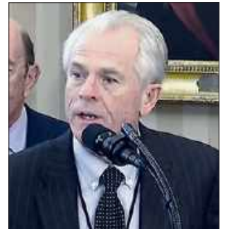
Peter Navarro, US Director of Trade and Manufacturing Policy, and an anti-China fanatic: "As soon as a bad actor like China cheats... it threatens the integrity of the global financial system and the global trading system."