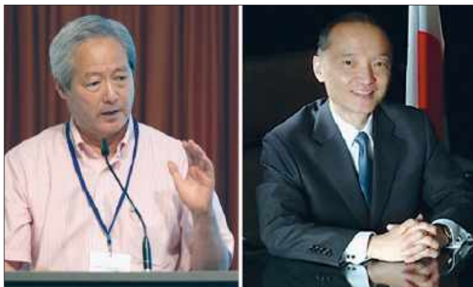
Daisuke Kotegawa in the Ministry of Finance (left) worked with Ishikawa Kaoru in the Ministry of Foreign Affairs (right), to develop a “Japan” in Africa.

The project, led by Kotegawa and Ishikawa Kaoru, a leading diplomat and Africa scholar in the Ministry of Foreign Affairs, was to choose three nations as targets for intensive development of their basic infrastructure, industry, health and