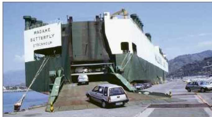
Japanese cars for export being loaded into the Swedish Vehicles Carrier ship Madame Butterfly at the Port of Shimizu, Japan.

Reagan's Commerce Secretary Malcolm Baldrige said in 1985 that