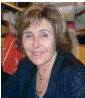
In the wave of "yellow peril" psychosis that swept Europe and the USA, Édith Cresson, Prime Minister of France, 1991-92, claimed Japan, in trying to help Africa industrialise, was not only trying to take over Africa, but the whole world!

As early as 1980, a leading Republican presidential candidate, John Connally, told the press: