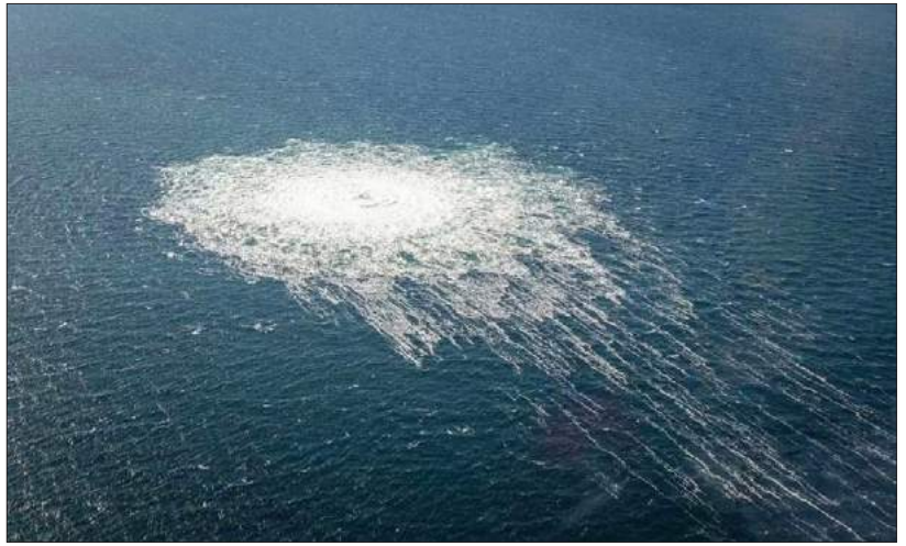
Gas bubbles up from the ruptured Nord Stream pipelines. Nord Stream AG reported on 2 Nov. 2022: “technogenic craters with a depth of 3 to 5 metres were found on the seabed at a distance of about 248m from each other. The section of the pipe between the craters is destroyed”.

German political leader and International Schiller Institute President, Helga Zepp-LaRouche, on 8 February demanded a full investigation into Hersh’s revelations and that the Bundestag (Germany’s Parliament) “demand accountability from the US government. The German government has a constitutional duty to prevent harm to the German people. The destruction of energy infrastructure strikes at the