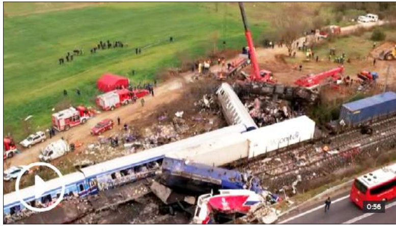
A train collision in Greece has sparked nationwide strikes and protests against privatisation.

On the other hand, China is leading the way by example, showing how investment in infrastructure does not weaken a nation's finances, but rather is the only way to advance. IMF head Kristalina Georgieva, speaking at the 2023 China Development Forum in Beijing on 26 March, noted that the Chinese economy will "account for around one third of global growth in 2023—giving a welcome lift to the world economy". According to Turkish state-run news agency Anadolu, IMF research also indicates that China's "productivity