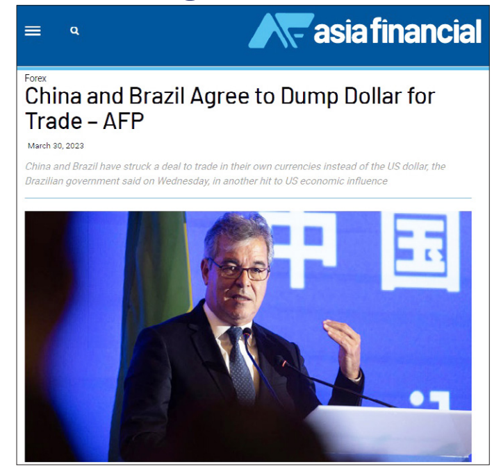
A new China-Brazil arrangement to trade in local currencies was revealed at the Brazil-China Business Seminar in Beijing on 29 March. Photo: Screenshot

At the instigation of the BRICS+ club (Brazil, Russia, India, China, South Africa), trade is increasingly conducted without using the US dollar for exchange purposes. China has just made its first purchase of energy from the Arab world using the Chinese yuan, and so has France! On 28 March, China National Offshore Oil Corporation and France's TotalEnergies announced their first yuan-settled liquefied natural gas deal, with a purchase from the United Arab Emirates, conducted through the Shanghai Petroleum and Natural Gas Exchange. This follows Chinese President Xi Jinping's December 2022 trip to Riyadh, where China and Saudi Arabia made progress in agreements to settle gas and oil trade in Chinese currency. ("China-Saudi agreements a marker of new economic system", AAS,