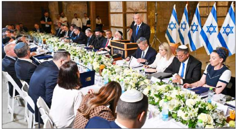
A sign of fast-advancing preparations for destroying the Islamic shrines and rebuilding Solomon's Temple: Israeli PM Benjamin Netanyahu chairs government cabinet meeting beneath al-Aqsa Mosque, the Temple Mount, 21 May 2023.

• Starting in 1862, when the Prince of Wales, later King Edward VII, led a large British delegation to the Holy Land, the first visit by a British monarch since Richard the Lionheart in the Third Crusade in 1270, the British elite stepped up their attention to Palestine. In 1865 Queen Victoria oversaw a gathering in London to establish the Palestine Exploration Fund (PEF), with money from the Crown, the masonic UGLE, the Rothschild family, and the Church of England, the attending Bishop of which proclaimed the Holy Land to be British property. Officers of the PEF went on to found, with the Prince of Wales, the Quatuor Coronati lodge in 1886, described as a revolution within freemasonry in that it was founded specifically as an "archaeological lodge", dedicated to digging for the site of Solomon's Temple. Eighty years later, hard on the heels of Israel's victory in the 1967 Six-Day War between Israel and its Arab neighbours, British establishment insider T.E. Allibone would dispatch his fellow Quatuor Coronati lodge member Prof. Asher Kaufman to Jerusalem on a mission